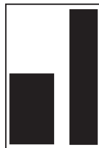
1/4 PAGE 4 7/8" x 5 5/8" 2 3/8" x 11 3/8"