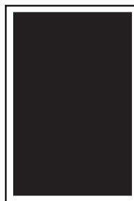
PAGE 10" x 11 3/8"