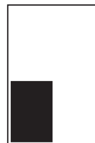
1/5 PAGE 4 7/8" x 4"