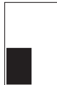
1/5 PAGE 4 7/8" x 4"