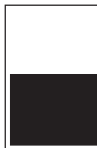
1/2 PAGE 10" x 5 5/8" (H) 4 7/8" x 11 3/8" (V)