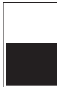
1/2 PAGE 10" x 5 5/8" (H) 4 7/8" x 11 3/8" (V)